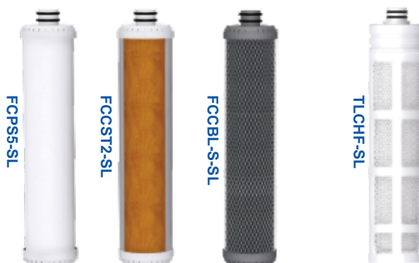
UF membrane EKOF4-SLIM-UF