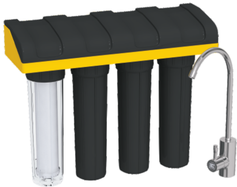
Cartridge set for EKOF4-SLIM-UF EKOF4-SLIM-UF-CRT